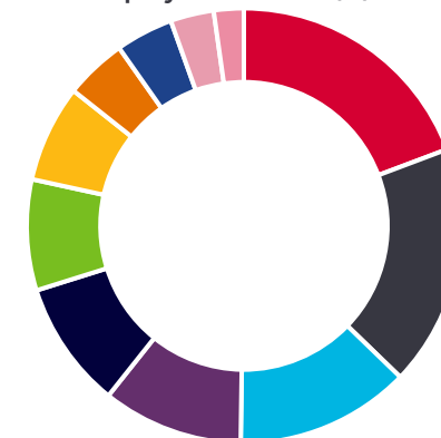
Equity breakdown (%)