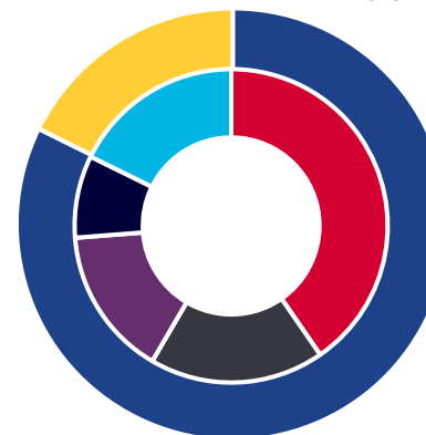
Fixed income breakdown (%)