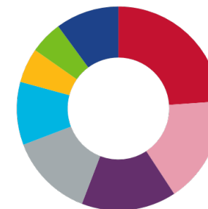
Bond Maturity Breakdown

■ 7-10 Years 23.9% ■ 1-3 Years 16.9% ■ 3-5 Years 15.1% ■ 5-7 Years 13.4% ■ 20-30 Years 10.0% ■ 10-15 Years 5.5% ■ 15-20 Years 5.2% ■ Other 10.1%