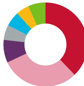
Shares Regional Breakdown

■ North America 37.8% ■ United Kingdom 30.2% ■ Asia Developed 8.8% ■ Europe Developed 5.8% ■ Asia Emerging 5.7% ■ Japan 5.0% ■ Other 6.7%