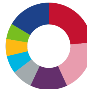
Shares Sector Breakdown

■ Healthcare 23.7% ■ Consumer Defensive 19.4% ■ Financial Services 13.9% ■ Technology 7.7% ■ Industrials 6.6% ■ Consumer Cyclical 6.4% ■ Communication Services 5.8% ■ Other 16.5%